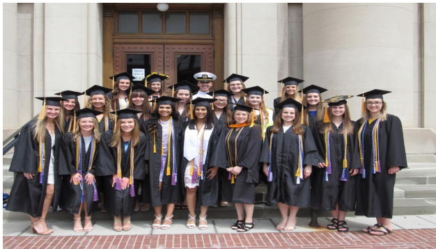
Proud graduates show off their Sigma honor cords on the steps of Hill Auditorium