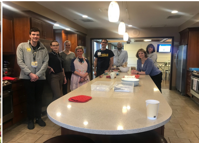
Rho Board members prepare and serve a meal at Ronald McDonald House: