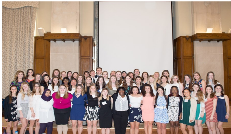
2017 Rho Chapter Inductees