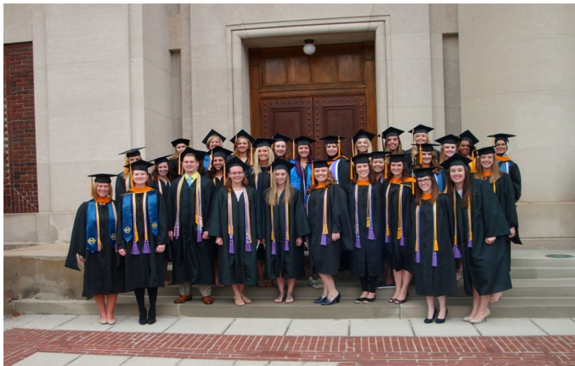
Rho chapter members gathered on the steps of Hill Auditorium before the School of Nursing Commencement ceremony on April 29.