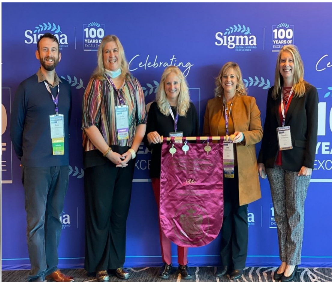
Rho Chapter receives its 4th Chapter Key Award at the 46th Sigma Biennial Convention

Chapter Web page The Circle: http://rho.sigmanursing.org