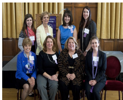
2014 Chapter Award Winners

https://www.flickr.com/photos/52147815@N04/sets/72157643654516055/show/