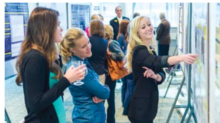
Students interact around posters.