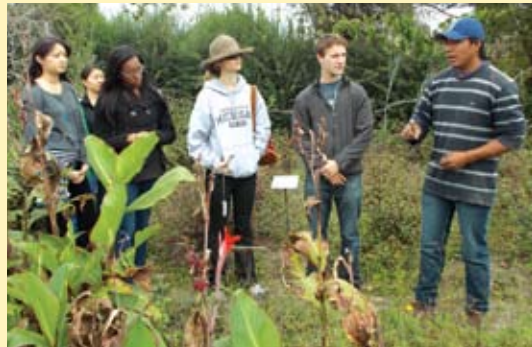
Undergrads learn about the use of herbs in health care while touring an Ecuadorian garden.