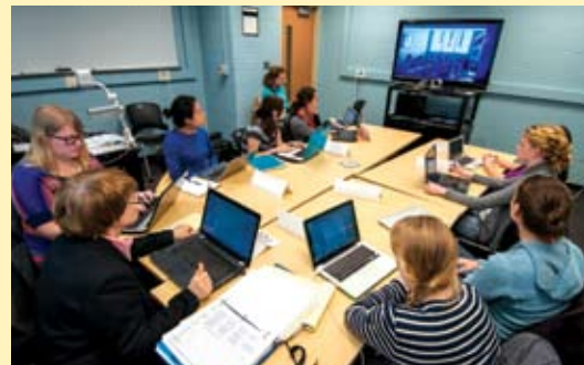
A new program allows community health nursing students to build relationships with peers in Haiti through videoconferencing.