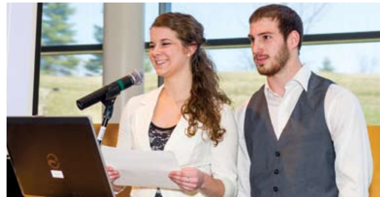
Presenting the Students' Choice Award.