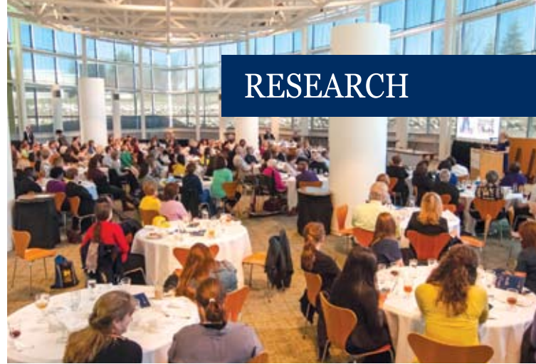
A full room for the day at U-M's North Campus Research Complex.